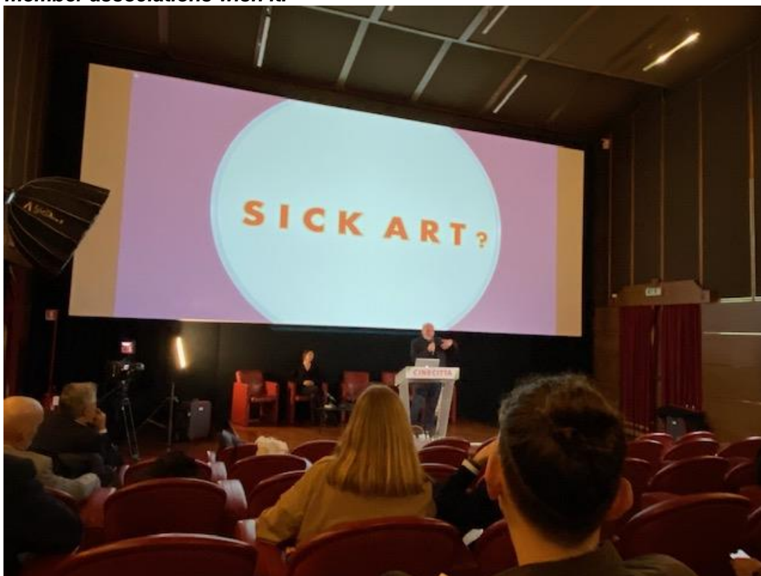
(Working Conditions presentation at Palazzina Fellini.)

environments of all our members. That means that we write supporting letters to governments, unions, producers' associations and other stakeholders if our member associations wish it."