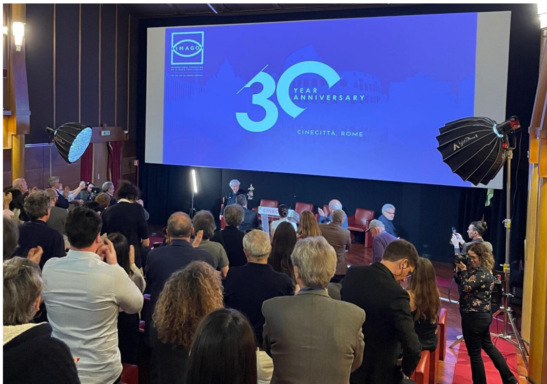
(IMAGO sponsor Aputure's Light Dome II's help to illuminate the stage of the iconic Palazzina Fellini)