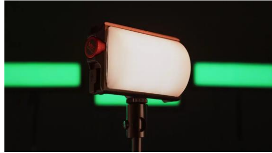
Rosco's DMG DASH

The AUTHORSHIP COMMITTEE forged relations and cooperation with other International and European Federations of the audio-visual sector. Once a month we are meeting with FERA (the European Directors), ArtScenico (the European Production and Costume Designers), TEMPO (International Editors), EFSI (European Sound) and ECSA (European Composers). We are also holding close relations to EUXXL – Interface Film.