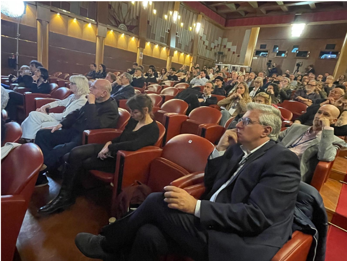
(IMAGO delegates at the Palazzina Fellini.)