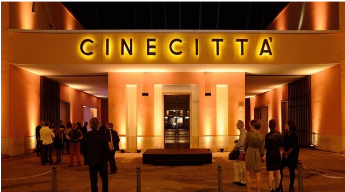
(Caption: Outside the Cinecittà Studio)

IMAGO recognised its landmark anniversary in conjunction with the IAGA. The event took place in Rome from 23 to 25 March and, I had the honour to attend and represent Australia on behalf of the Society.