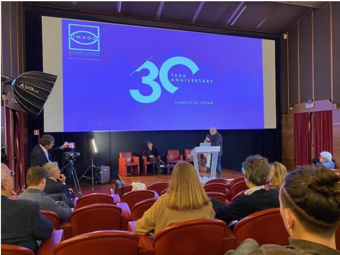
( Working Conditions presentation at Palazzina Fellini.)